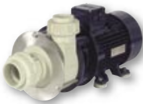
Front sight CW Drive motor running clockwise

One way or the other. This pump fits to your application