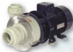
Front sight AW Drive motor running anti clockwise